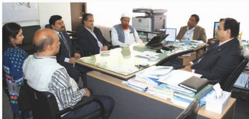
A team from Chittagong WASA visited Dhaka WASA to share experience of providing Water and Sanitation Services to the Low Income Community (LIC) within DWASA network on 19 December, 2012.