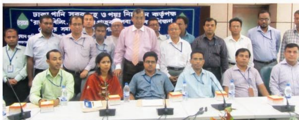
After a training, a group of DWASA officers pose for a photograph with top management of the organisation.